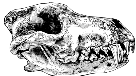
CANIS DIRUS

The UCMP has been awarded a new four-year NSF Advancing Digitization of Biological Collections program grant for "Documenting Fossil Marine Invertebrate Communities of the Eastern Pacific: Faunal Responses to Environmental Change over the last 66 million years." Collaborating institutions include the University of Alaska, Fairbanks, University of Washington, University of Oregon, the LA County Museum, the Museum of the Earth, and the Cooper Center. 🐾